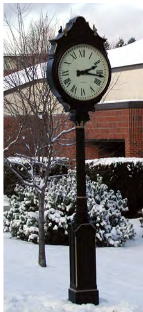
Saint Anselm College Manchester, NH