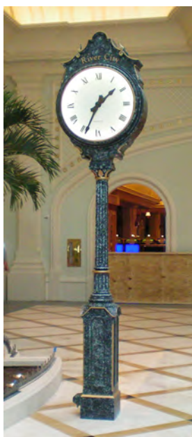
Saint Louis, MO