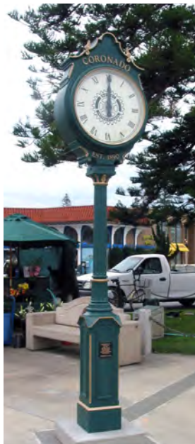
Rotary Club of Coronado Coronado, CA