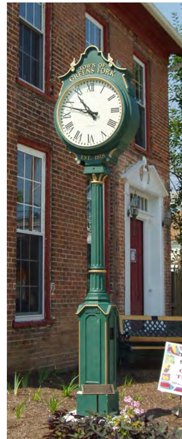
Greens Fork, IN