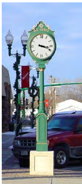
Farmington Lions Club Farmington, MN