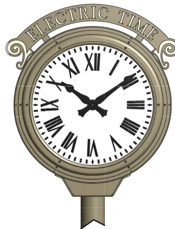
Optional Swirled Header (with raised aluminum text)