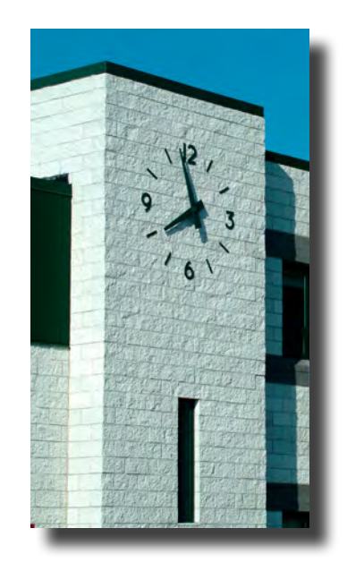
Ty-Wood Corp. Holliston, MA