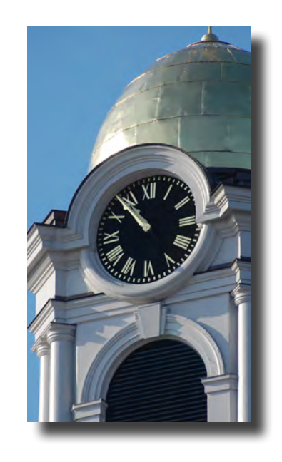
Needham Town Hall, MA