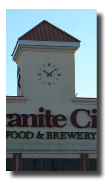
Granite City Food and Brewery Sioux Falls, SD