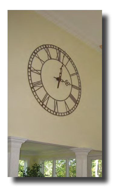
Great Room Private Residence