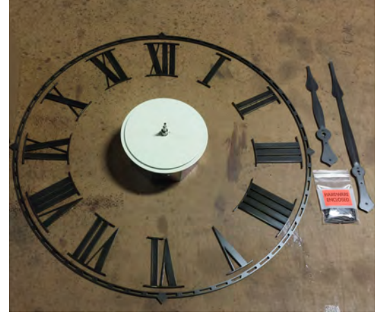
Style 1000 Front Access Clock with Special Trim Ring Prepared for Shipment