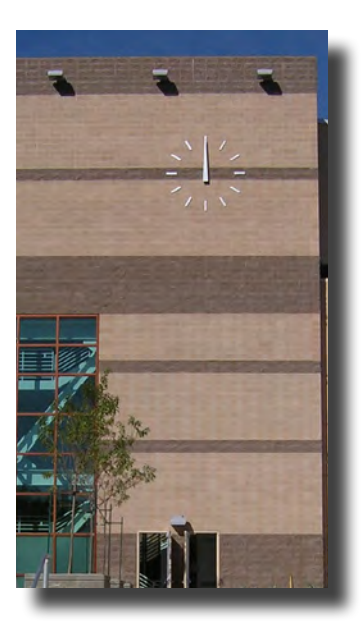
Port of Los Angeles Police Headquarters San Pedro, CA